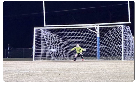
Girls Soccer Vs. Griffin