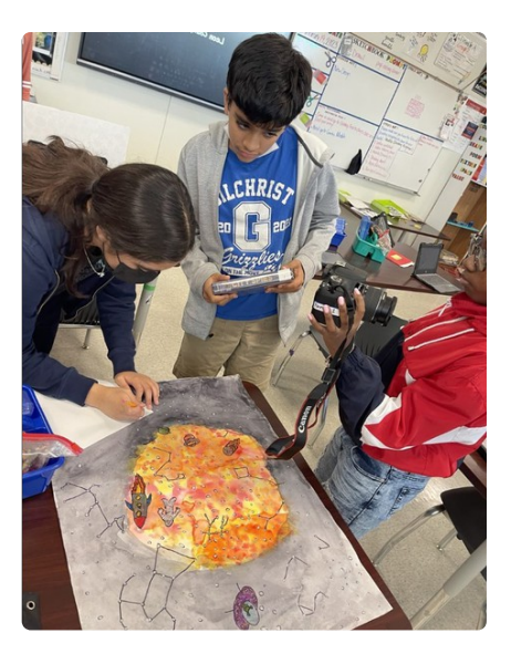
Digital Photography Class